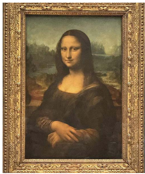
Of course, one must visit The Musee du Louvre (again; was