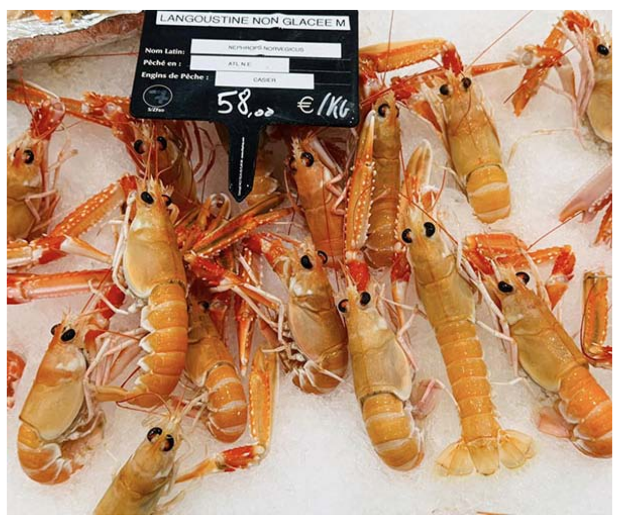
We took a stroll down Rue Cler, which is a long pedestrian street with wonderful seafood, produce, flowers and other kinds of food and drink shops. Check out these colorful prawns priced at 58 Euros per Kg., or $28 per pound.